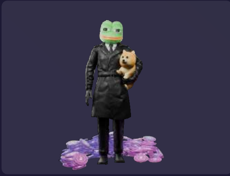
PEPE WIF DOGE